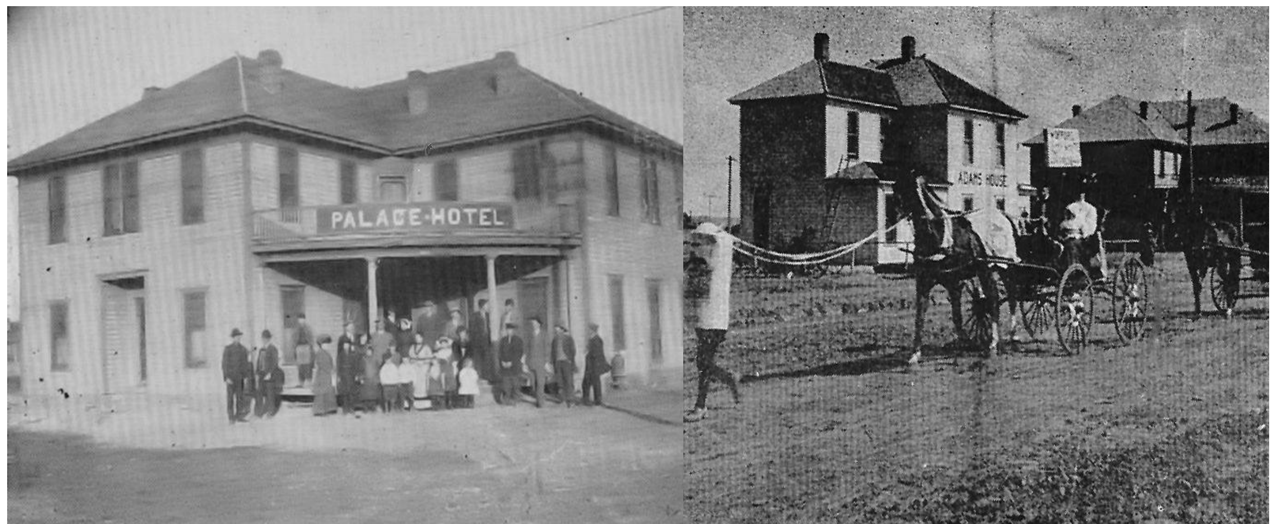
The Palace Hotel, later known as the Tucumcari Motel (L) and the Adams House (R) were two very busy and prominent hotels from Tucumcari's past.