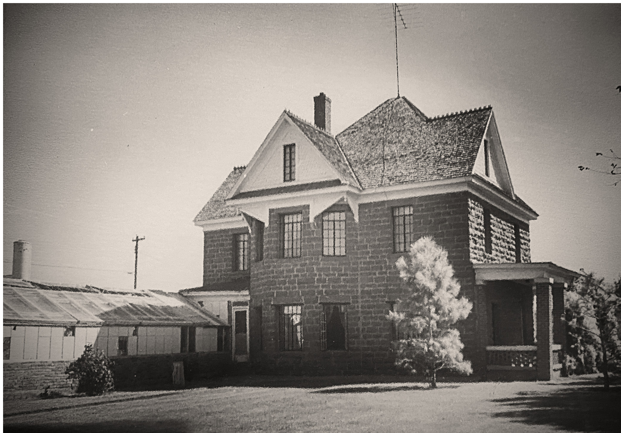
Built in 1907, the lovely Hospitality House was home to many families over the years and may still hold onto some of those spirits.

Find out about a true local hero and a founder of Tucumcari who had a life that spans some amazing history that could be a book all of its own.