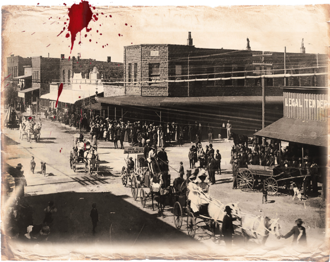
Main Street in the early 1900s in Tucumcari: The Legal Tender may have held one of Tucumcari's best kept secrets.

Walk the old streets, listen to the stories and discover if the tough, restless wild spirits of early Tucumcari still haunt both sides of the track.